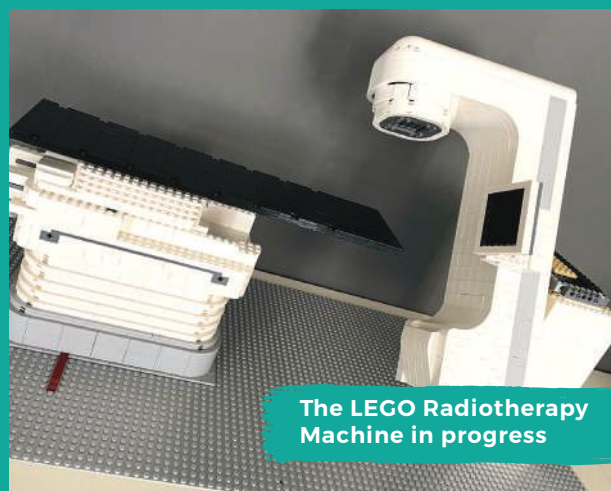
The LEGO Radiotherapy Machine in progress

A hospital stay can be daunting for children, especially when they must undergo scans and procedures involving machinery that can seem loud and scary! To help tackle this in Paediatric Radiotherapy, Newcastle Hospitals Charity – via our Great North Children's Hospital Foundation – has funded the build of a custom LEGO model of a radiotherapy machine, to help show young patients what to expect. The model, which has been built by local LEGO architects Brick This, will be large enough to fit a Barbie-type doll in, to show the patient where they will lie in the machine. Bethany Cockburn, a Nurse Specialist in Paediatric Radiotherapy, who applied for the funding said: "Radiotherapy can be scary, especially for children, and especially when you see the machine for the first time. This fab model is going to be so, so useful in helping us explain to young children how their treatment is going to work, and it also looks cool – like something from Star Wars! Steve from Brick This has been a joy to work with and the process of applying for a small grant from Newcastle Hospitals Charity was straightforward too."