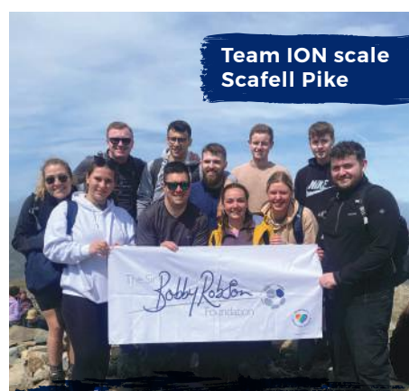
Team ION scale Scafell Pike

In 2019, we announced £985,000 in funding for a groundbreaking project called COLO-SPEED, which aims to speed up bowel cancer research and recruit more patients to participate in it.