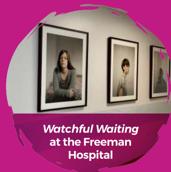
Watchful Waiting at the Freeman Hospital

Following on from a partnership with The Open University, we also held a successful Creative Writing Competition with 3 finalists who received book tokens as a prize, and will be displaying their original works in the hospitals.