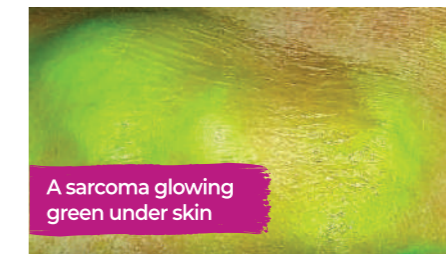
A sarcoma glowing green under skin

This new trial uses a harmless green dye called ICG (indocyanine green), which is injected into the vein of a patient the afternoon before surgery. The ICG dye then builds up in the sarcoma and clears away from the normal tissues around the cancer.